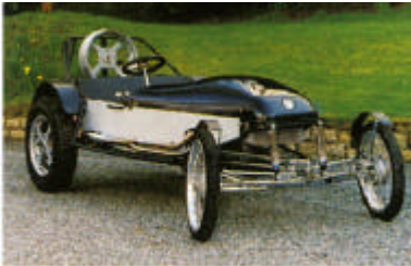
Radical 80T trials car boasts Honda power