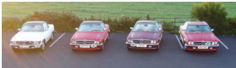
The 4 Mercedes SL's parked near the Giant's Causeway

Another early start on Tuesday morning, we left Killarney passing through Killorglin on our way around the Dingle Peninsula. The Connor Pass from Dingle town to Stradbally brought us on to the road for Tralee, Listowel and an enjoyable ferry trip across the Shannon Estuary to Kilrush and the Cliffs of